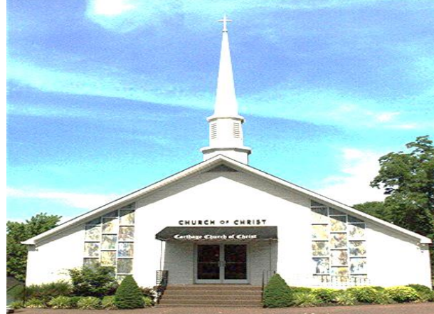
MEETING PLACE OF THE CHURCH OF CHRIST

“Let your light so shine before men, that they may see your good works, and glorify your Father which is in heaven.”(Matthew 5:16)