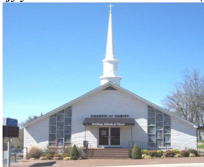
MEETING PLACE OF THE CHURCH OF CHRIST

“Let your light so shine before men, that they may see your good works, and glorify your Father which is in heaven.”(Matthew 5:16)