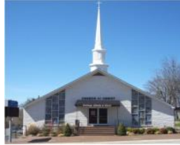
MEETING PLACE OF THE CHURCH OF CHRIST

“Let your light so shine before men, that they may see your good works, and glorify your Father which is in heaven.”(Matthew 5:16)