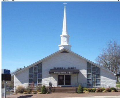
MEETING PLACE OF THE CHURCH OF CHRIST

"Let your light so shine before men, that they may see your good works, and glorify your Father which is in heaven." (Matthew 5:16)