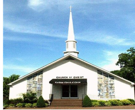
MEETING PLACE OF THE CHURCH OF CHRIST

"Let your light so shine before men, that they may see your good works, and glorify your Father which is in heaven."(Matthew 5:16)